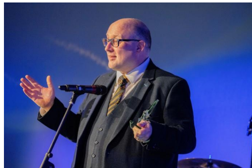
Sir Aspinall (Matrix)